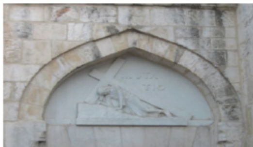
Stations of the Cross in Jerusalem: The Third Station, Jesus Falls for the First Time

The Good Friday Offering brings The Episcopal Church together across all of our cultures, languages, and ethnic diversity – from domestic and overseas dioceses, North and South and